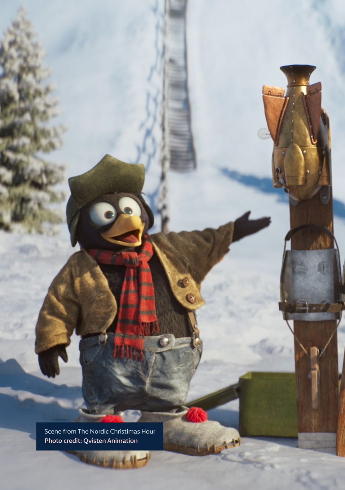
Scene from The Nordic Christmas Hour