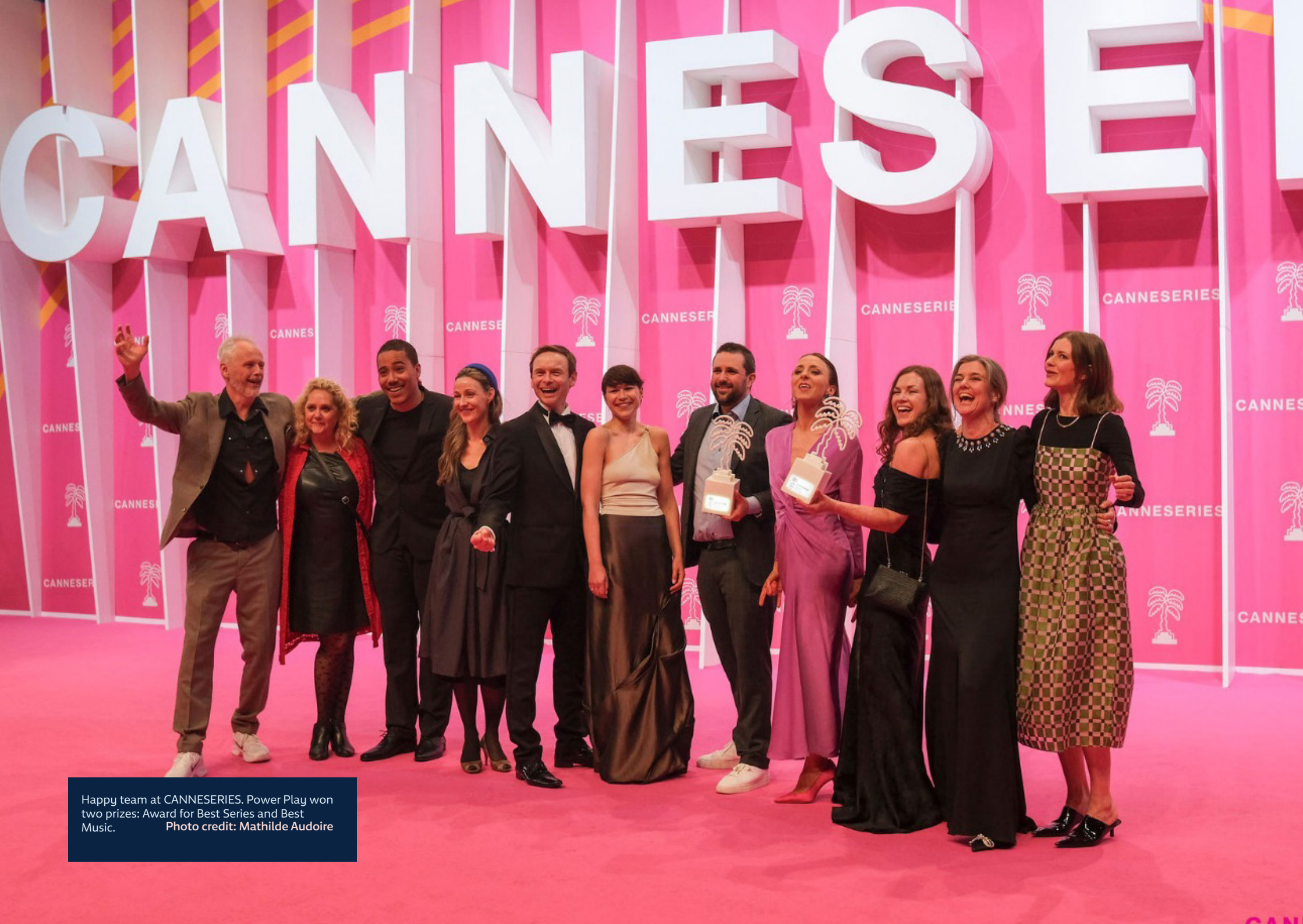
Happy team at CANNESERIES. Power Play won two prizes: Award for Best Series and Best Music.